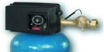
1 ½” valve